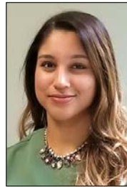
JEEVAN SANGHA Coordinator